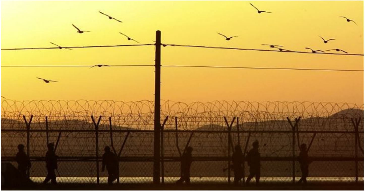
South Korean army soldiers patrol along a barbed-wire fence near the border village of Panmunjom in Paju, South Korea, on March 26, 2013.

Some have focused on the discipline of philosophy specifically and others have addressed representation in the university more generally. Honestly, the students, staff, faculty, and community organizers I have worked with are some of my strongest inspirations. Their tenacity and their hope. Their bravery in the face of an often unwelcoming institution. Their commitment to collectively transform our political imagination. Each of these things is critical to the philosophical life. It is with and for them that I work to make philosophy open and answerable to marginalized experience. And use philosophical tools to address systems of inequality and social erasure.